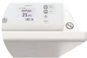
Intuitive Display Screen